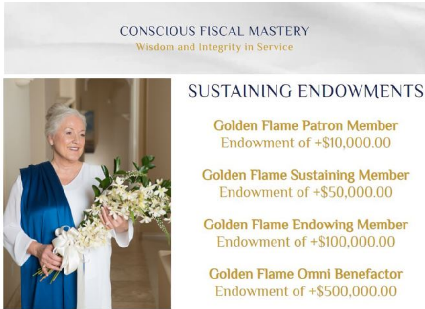
Above: Make the lie big, make it simple and keep repeating it and eventually people will believe it!